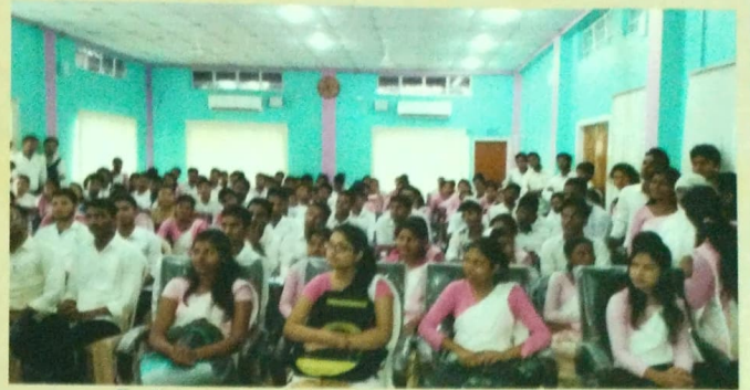
Participant in the Workshop on Holistic Development