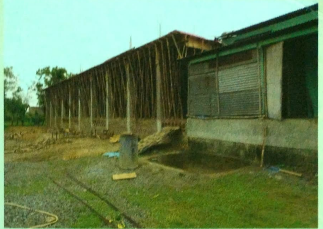
New RCC Class Room under construction