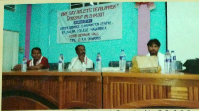
Workshop on Holistic Development, Organised by C.G. & C.C.