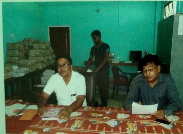
Evaluation Zone, TDC 2nd Sem. (Arts), 2017