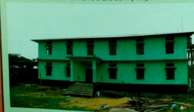
New Girls' Hostel