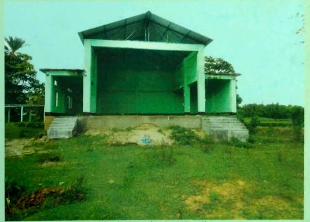
Auditorium under construction