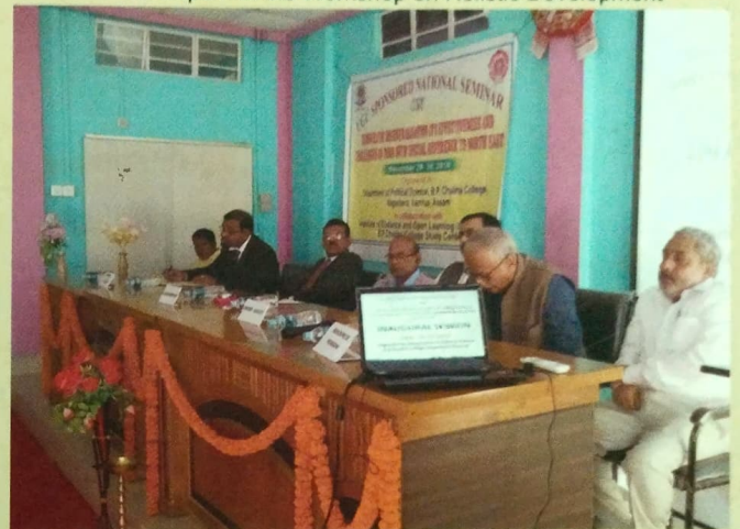
National Seminar, Organised by Dept. of Political Science