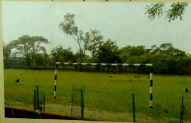
College Play Ground