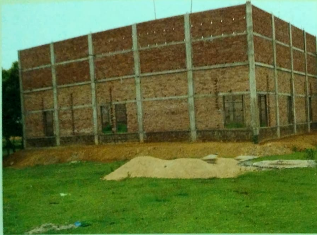
Indoor Stadium under construction