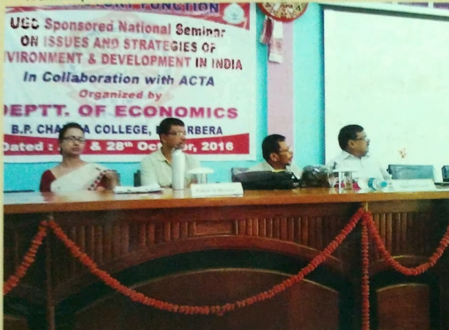
National Seminar, Organised by Dept. of Economics