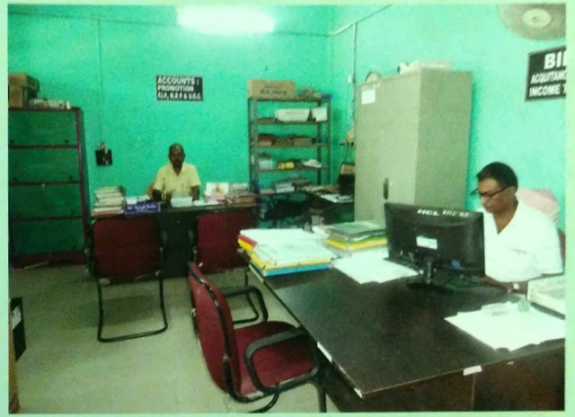
Office Staff at Work