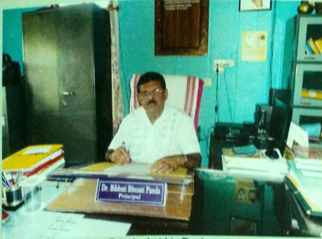
Principal at his Desk