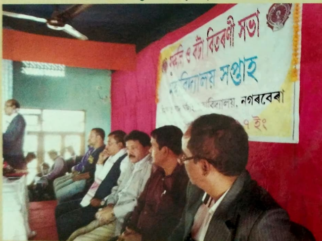
Open Meeting : College Week, 2017