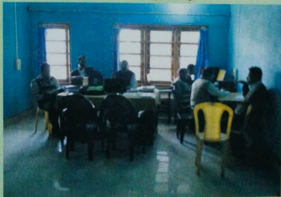
A view of IQAC, B.P. Chaliha College

The Internal Quality Assurance Cell of B.P. Chaliha College is the apex body to monitor, control and facilitate the academic activities of the college through the Cells and sub-committees under it for providing a healthy and meaningful study environment.