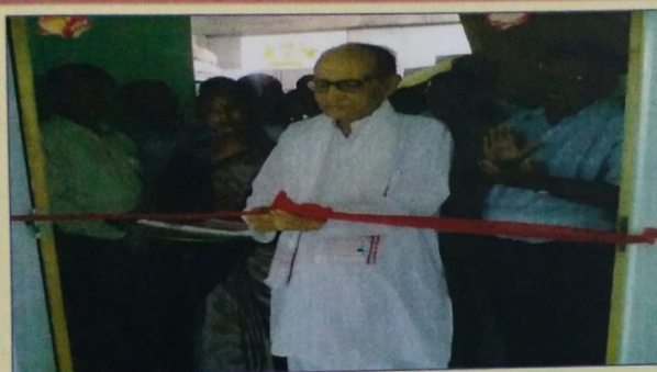
Inauguration of Language Laboratory