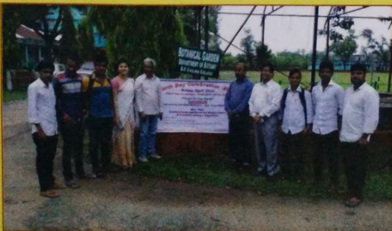
Earth Day Celebration by Innovations and Best Practices sub-committee.