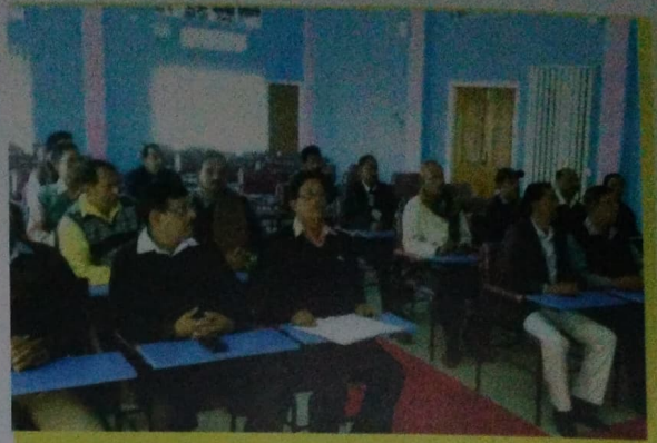
Interior View of Conference Hall of B.P.C.C