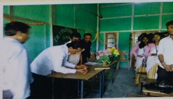
Seminar conducted by Department of English:

organised by Department of Economics, B.P.C.C.