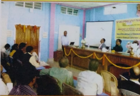
Seminar on Astrophysics organised by Physics Deptt. and Science Forum of B.P.C.C.