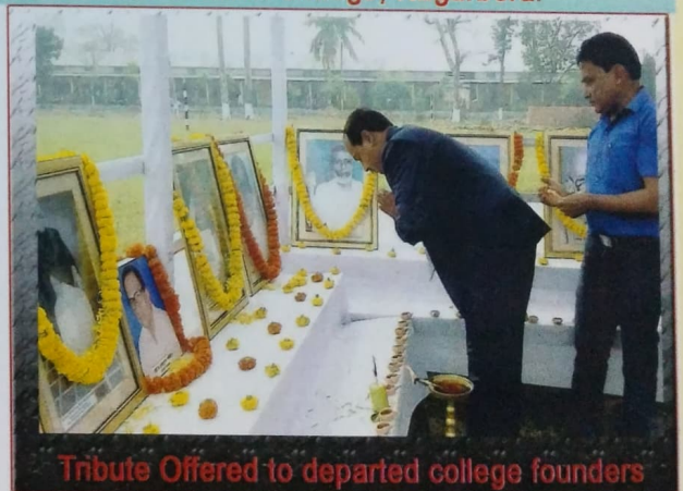
Tribute Offered to departed college founders