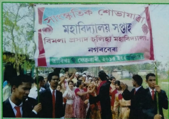
Cultural procession during college week 2016

The mission statement of the college reads "Tomoso Ma Jyotir Gamaya" which reflects the quest of the college to remove the darkness of ignorance and spread the light of knowledge