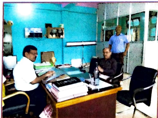
Principal in discussion with V.C., G.U.