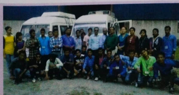
Educational Excursion to Bhutan by Department of Economics

organised by Women Empowerment Cell, B.P.C.C.