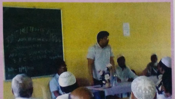
Joint Teachers and Guardians Meet Organised by the Department of Arabic