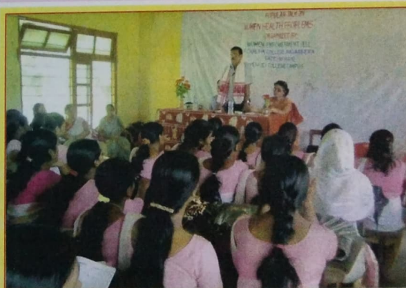
Popular Talk on Women's Health Problem

organised by Women Empowerment Cell, B.P.C.C.