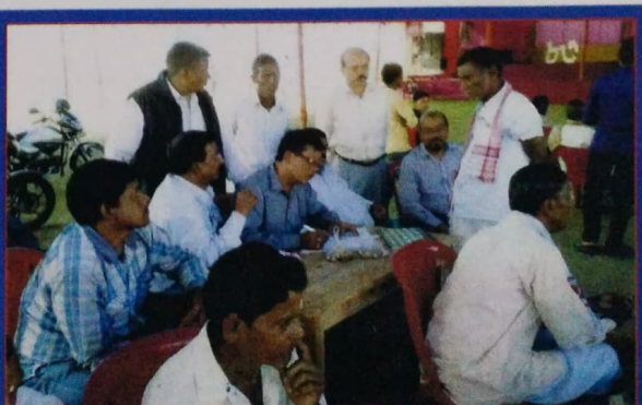
Health Checkup Camp by Health Club BPCC.