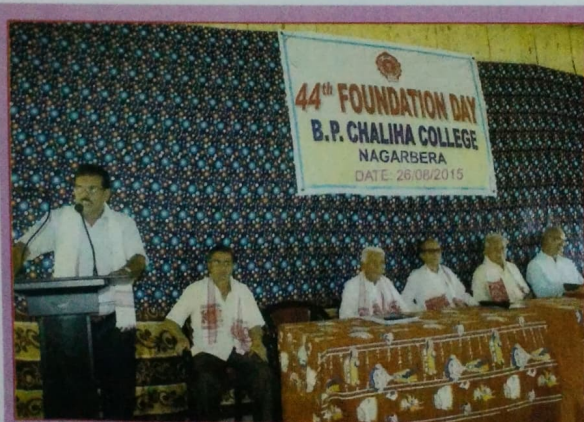
Celebration of the Foundation Day of the College Date: 26/08/2015

The college is now having more than 1600 students, about sixty teaching faculties and nearly forty other officials and supporting staff to serve its interest. The college is preparing itself for the next round of assessment of NAAC which is hoped to be very positive.