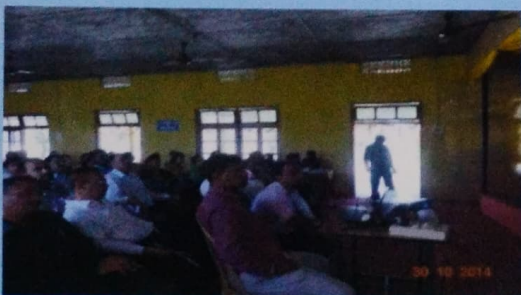
A one day ICSSR-NER sponsored regional -

seminar was organised on “Changing Scenario of development of North East India by the department of Economics, B.P.Chaliha College, and Nagarbera Kamrup Assam on 30 th October 2014 in collaboration with Teachers Unit of the College. The seminar was organised to find out the causes and responsible factors of non development in fields of education, agriculture, infrastructure, health and sanitation, women empowerment, ICT development etc. The seminar was attended by 106(one hundred and six) participants from the universities and colleges of the North East region. A total of 25 (twenty five) research papers were presented by the researchers and interacted with the participants, where positive and negative comments were forwarded by the resource persons. After lighting the lamp by Mr. U.C Talukdar, President Governing body of the college, the key note address on the Changing scenario through e-governance and optimum allocation and fruitful distribution of resources was delivered by Dr. Nissar Ahmed Baruah, Head Department of Economics, Gauhati University.